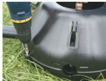
Secure top body by screws around the base.