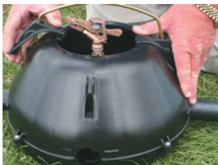
Fix wire clip into opposing holes on body sides.