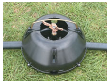
Flush the irrigation line prior to fitting the pipeline end cap to remove any drilling debris left in the pipe.