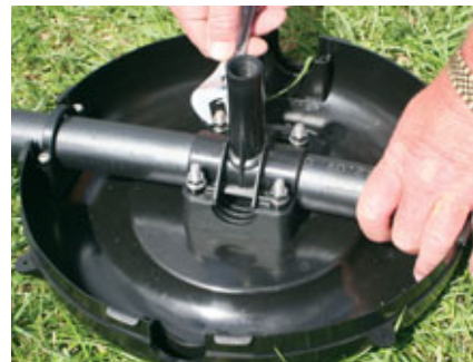
Fit rubber seal to sprinkler riser, locate riser onto pipe and cross tee anchor - ensure fastening nuts are tightened evenly.