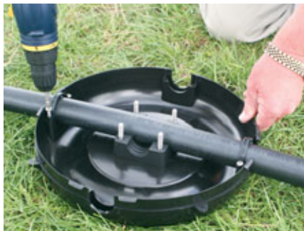
Lay pipe over Skid Base and secure in position with Cross Tee Anchor and Clamps.