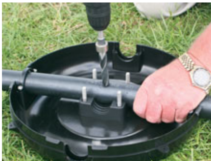
Drill 15mm (9/16") hole on metre mark on pipe and remove all drilling swarf.