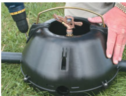
Screw wire clip holders into the holes provided.