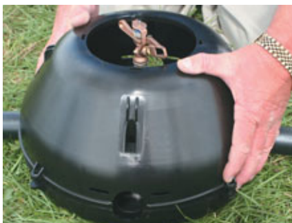
Locate body on skid base and push firmly down to engage grip lugs.